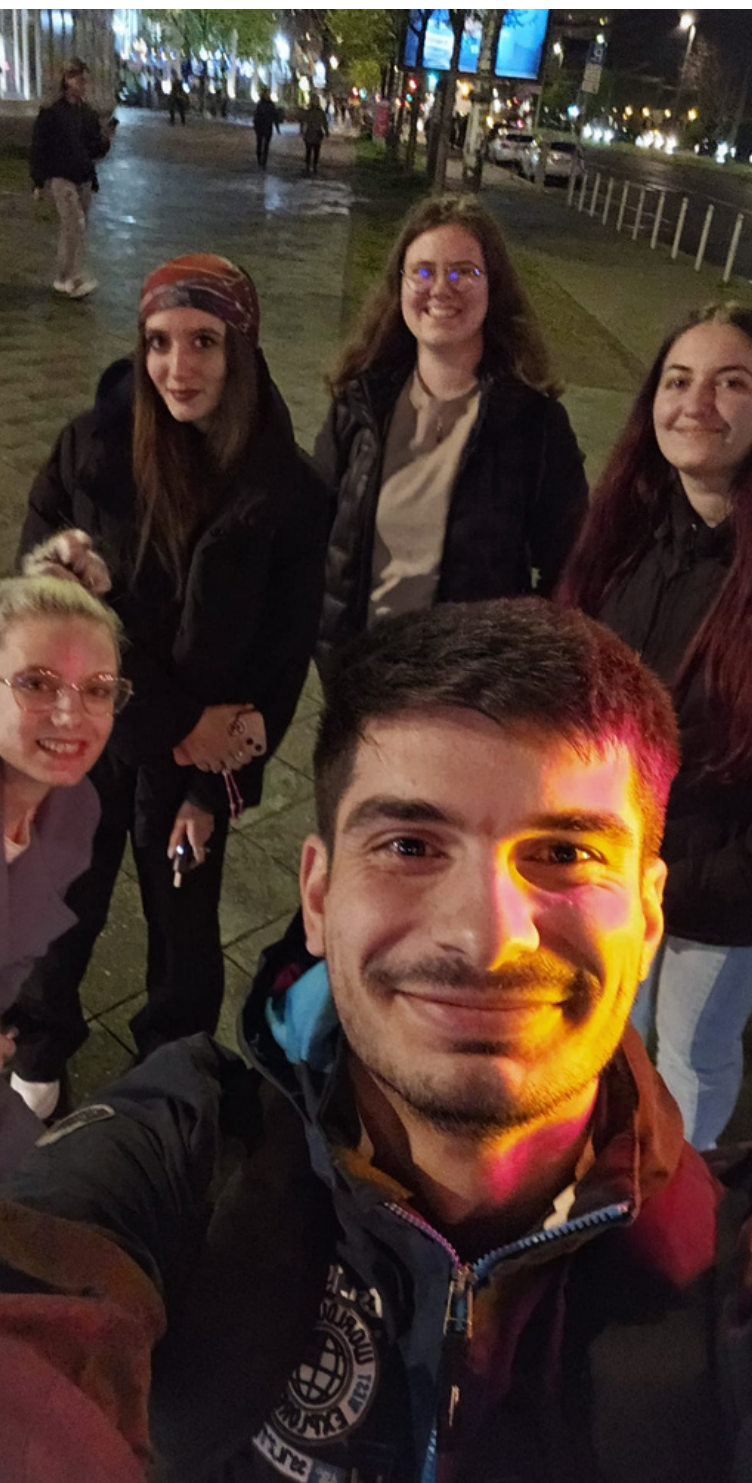
PHOTO: Students from the Bucharest University of Economic Studies participate in April 2023 in the Berlin hybrid mobility organized by ESCP Berlin campus in Erasmus+ Project FOReSiGHT 2020-1-RO01-KA203-080368 (ASE consortium lead)