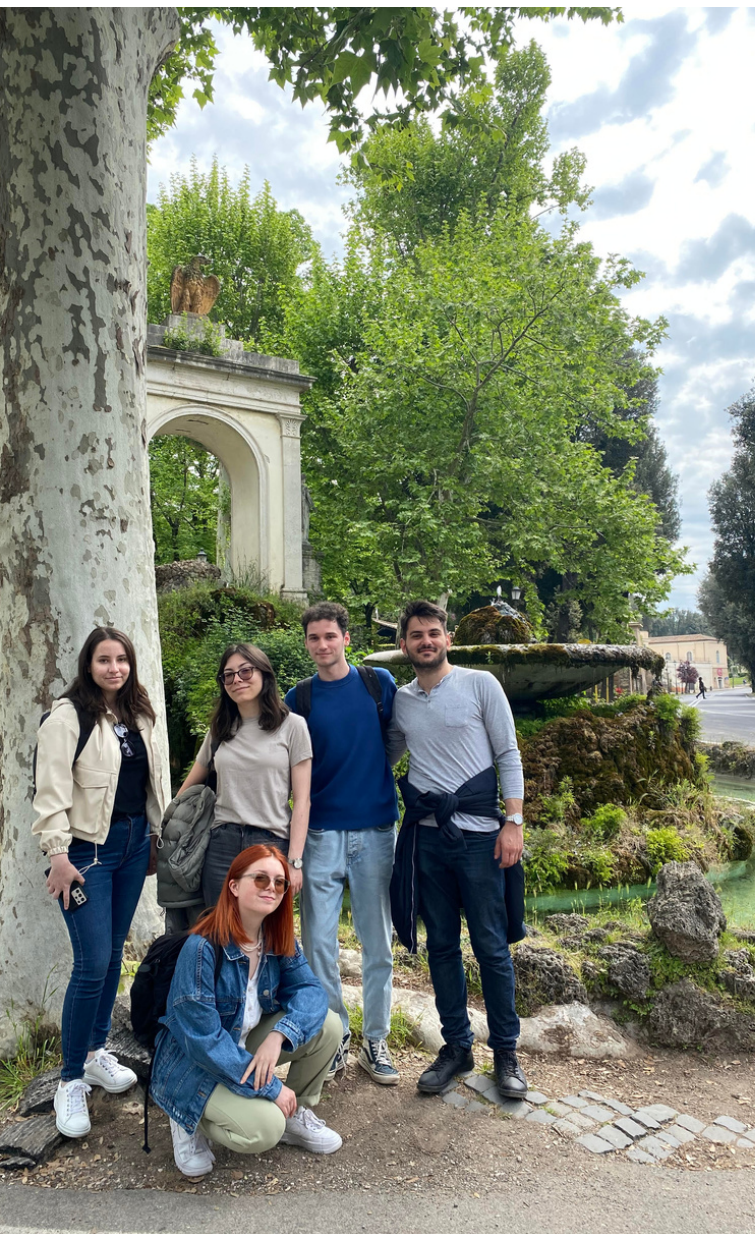
PHOTO: Students from the Bucharest University of Economic Studies participate in April 2023 in the Rome hybrid mobility organized by Sapienza University of Rome n Erasmus+ Project FOReSiGHT 2020-1-RO01-KA203-080368 (ASE consortium lead)