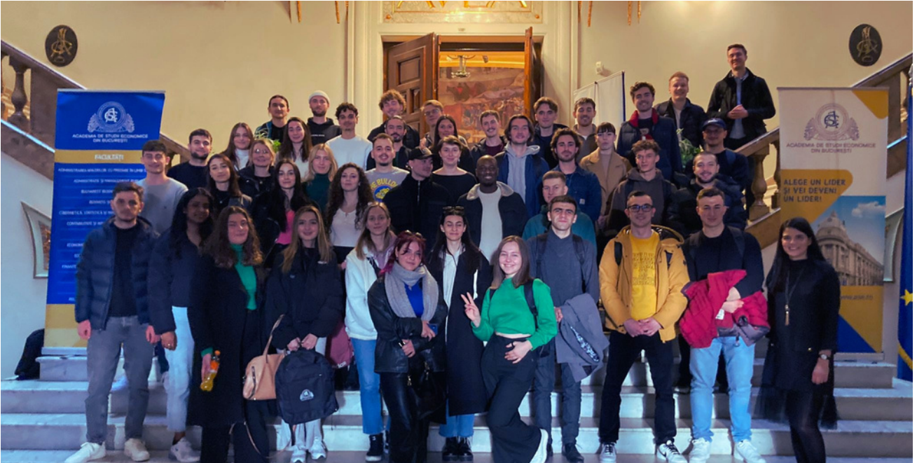
PHOTO: Welcome Day in February 2023 for our incoming Erasmus+ students studying at ASE in the spring semester

Workshop on cultural adaptation for international students