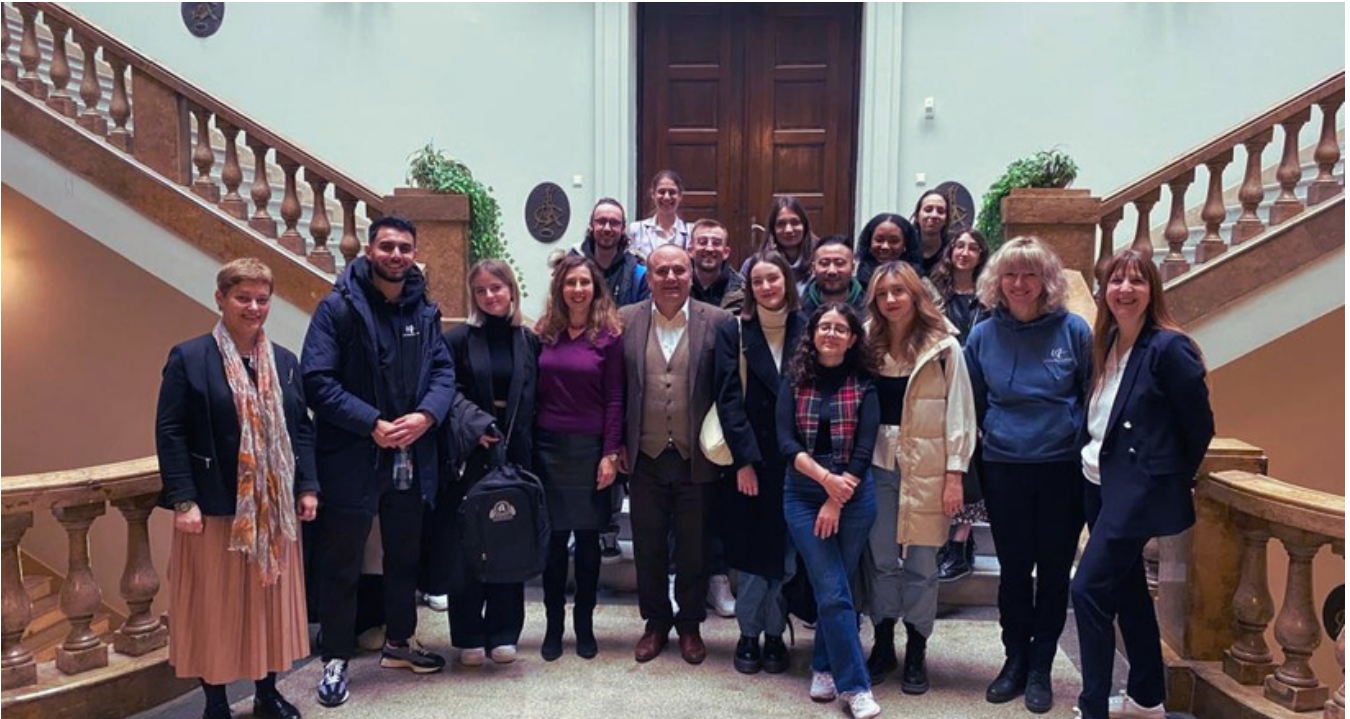
PHOTO: Welcoming in March 2023 a delegation of students and professors from our partner, the University of Artois, from France within our double degree agreement for bachelor studies with the Faculty of International Business and Economics, Applied Modern Languages.